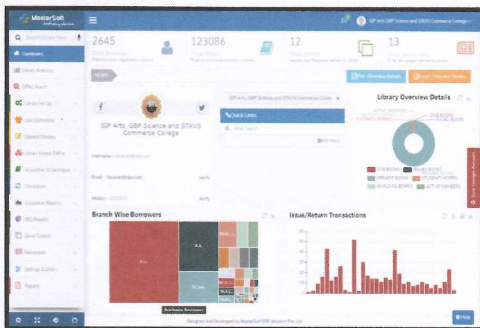
User Interface (Web Version)