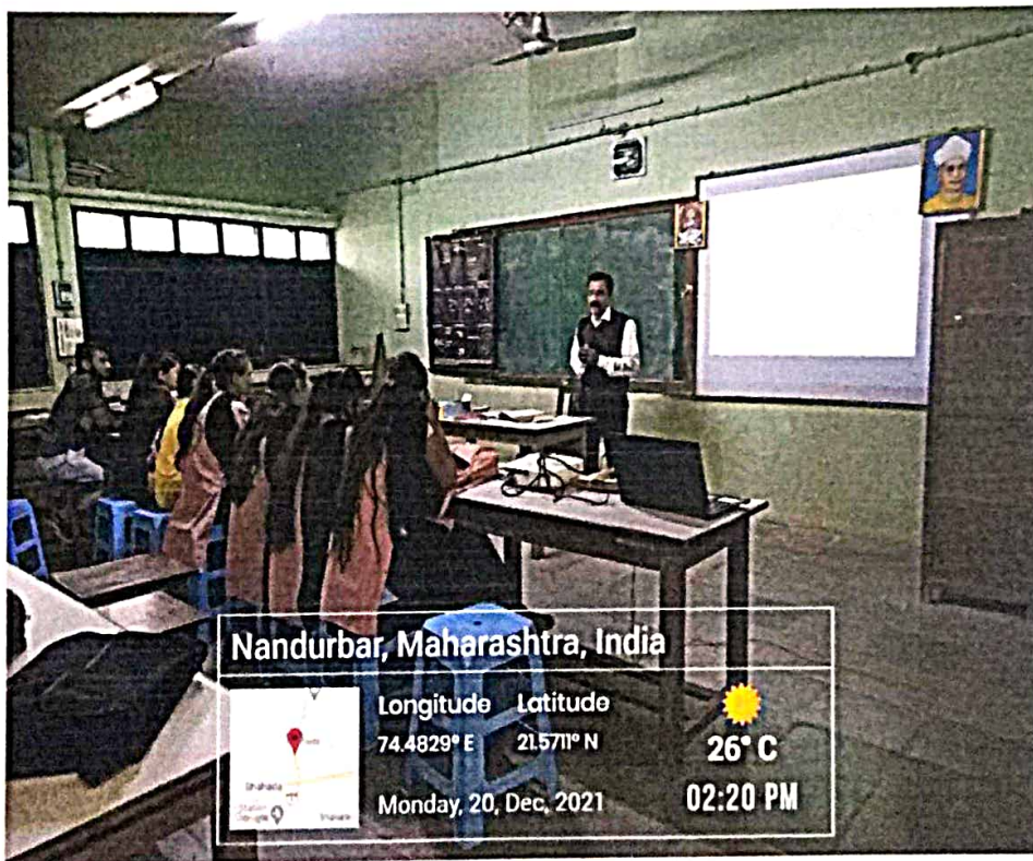
USE OF ICT Geo-tag PHOTO AND LINK (Department of Botany)

Principal PSGVPM's S.I.Patil Arts, G.B.Patel Science & S.T.K.V.S Comm. College, Shahada, Dist.Nandurbar(M.S.)