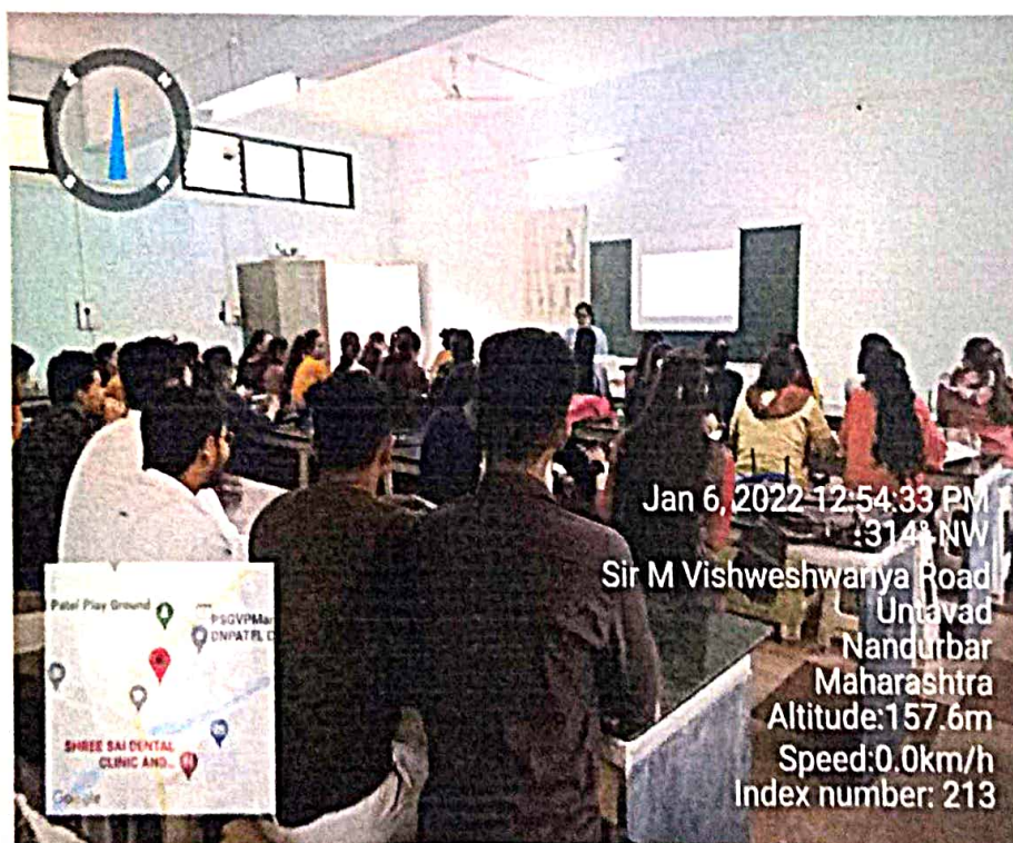
USE OF ICT Geo-tag PHOTO AND LINK (Department of Microbiology)