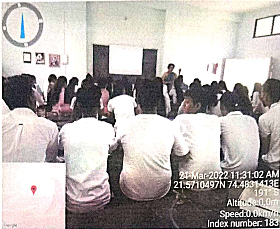
USE OF ICT Geo-tag PHOTO AND LINK (Department of Microbiology)